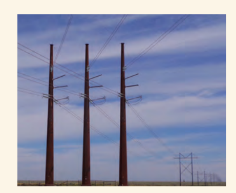
A 345 kV substation was completed outside Dora in July, 2015. The Crossroads Substation was built to connect the Roosevelt and Milo wind farms. The transmission line structures shown above were also built to move power into the new Crossroads substation.

Foundation work is also taking place at the Andrews County Substation on the Texas border near Eunice, New Mexico. Construction is also underway at the NEF Substation. The Andrews-National Enrichment Facility (NEF) 115 kV transmission project includes two miles of new transmission line between the Andrews and NEF Substations.