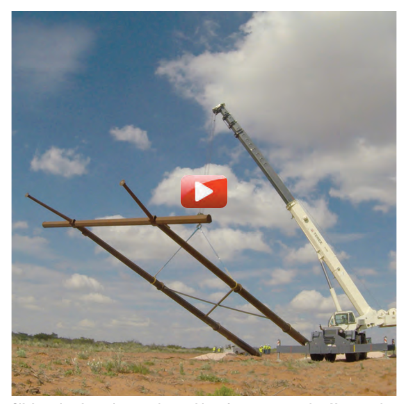
Click on the photo above to view a video of a structure setting. You can also see the video on PowerforthePlains.com.