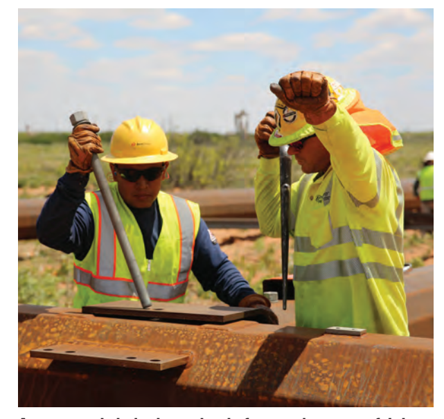
A structure is bolted together before setting west of Jal.